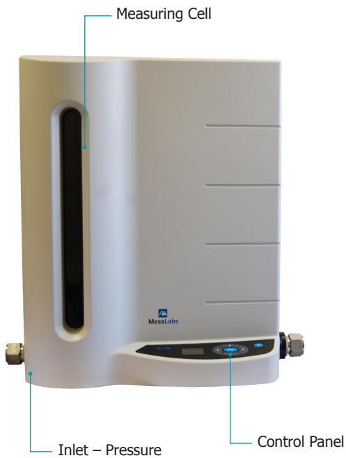
Figure 1: Front View, DryCal 1500