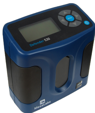
Discontinued Defender 530